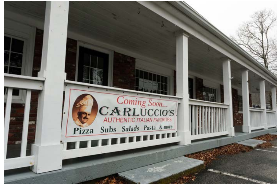
Photo taken pre-Grand Opening in 2022